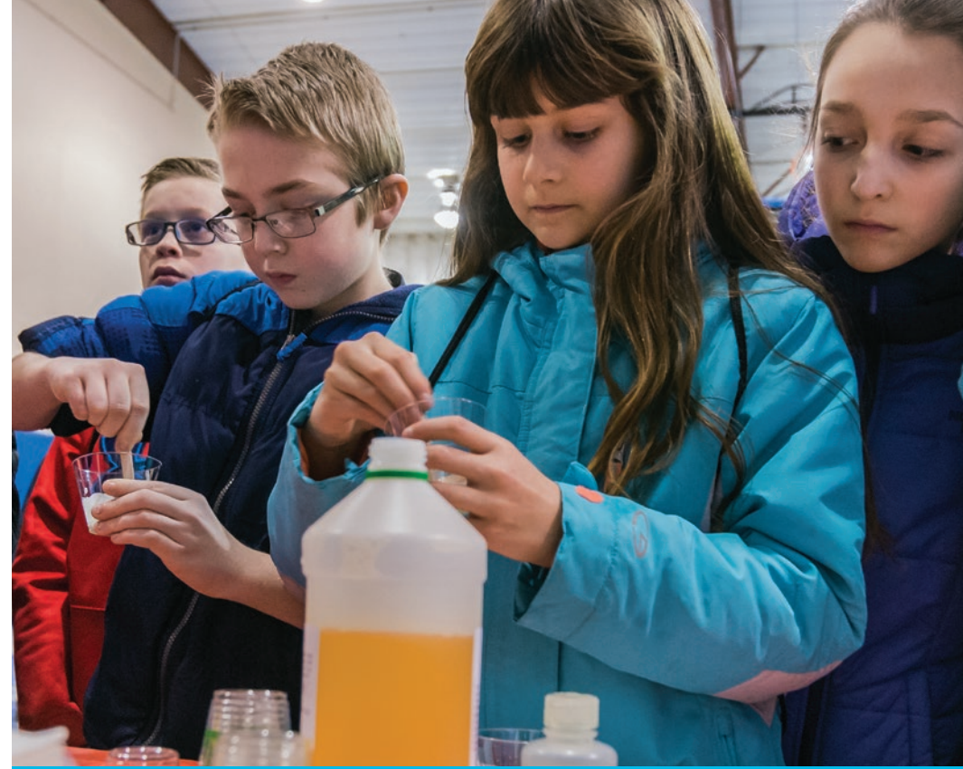
Fifth-graders at Pennsylvania College of Technology's annual Science Festival experiment with the chemistry of polymers. The Society of Plastics Engineers is one of many industry partners that participates in the popular festival that provides fun hands-on activities geared to elementary and middle school students and their families.

"Working Class: Competition Drives Innovation! Why Science Matters" is the fourth in a series of award-winning documentaries that connect career awareness and academic subjects. In addition to public television broadcast, series videos appear on YouTube and the workingclass.tv website.