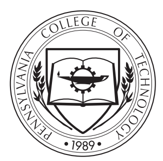
Office of Admissions

Copy can be added under or above, but not around the official seal.