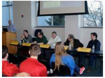
Project roundtable opens window on work in progress

Penn College president presents budget request to state Senate