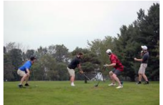
Alumni Golf Outing