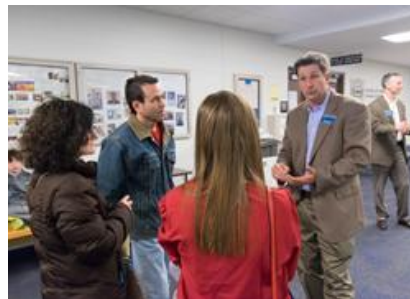
Spring Open House Saturday, March 24