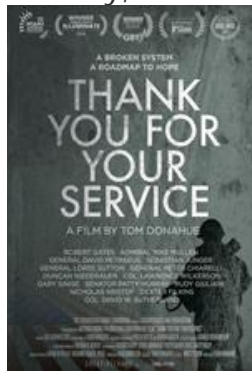
Free Screening of Award-Winning Documentary Scheduled Wednesday, March 21