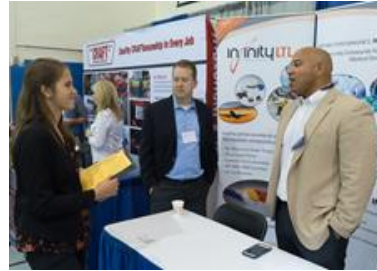
Spring Career Fair Tuesday, March 20